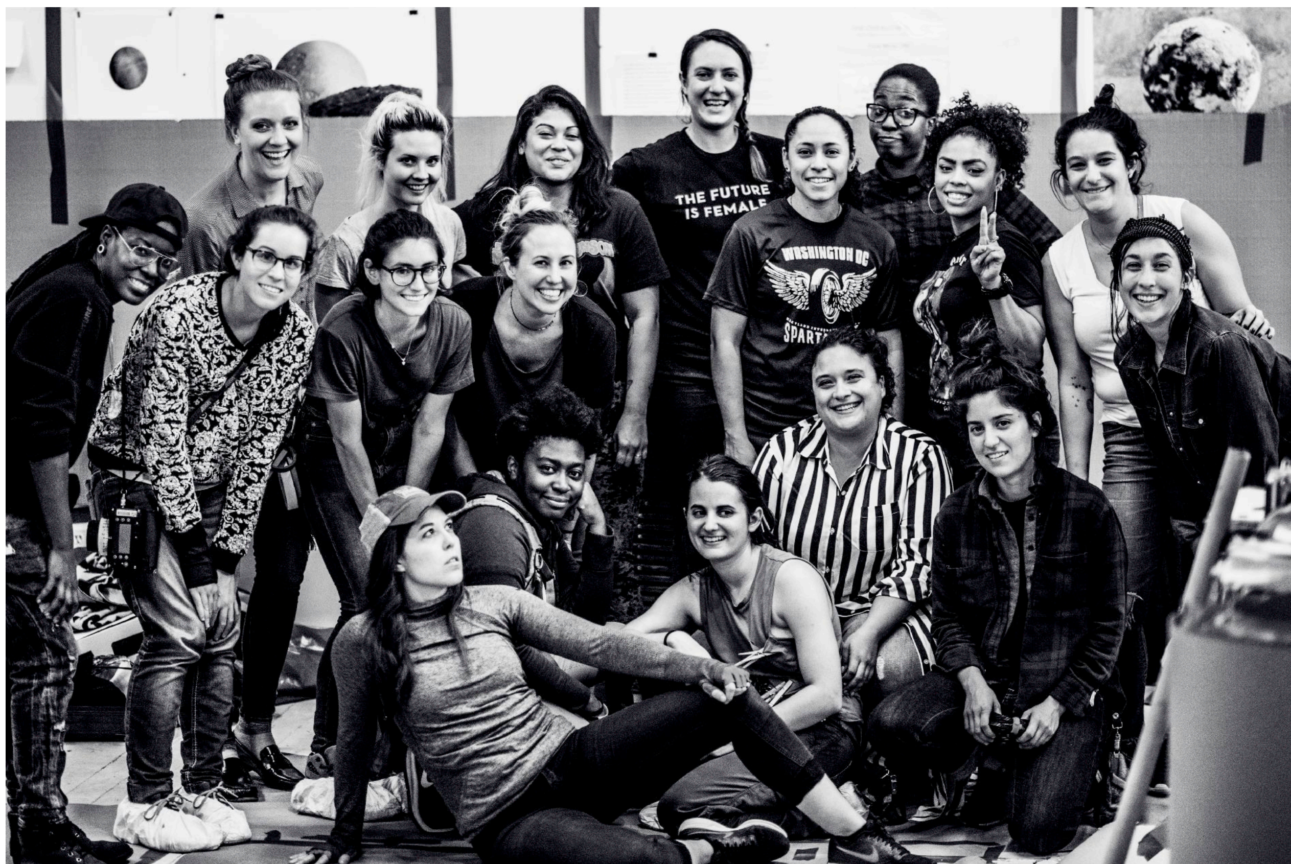
The all female crew

EDC: As a former actor I knew I'd prefer a woman behind the camera if I were filming a rape scene, so it started with "we need a female DP and camera team." But I'd always wanted to work with an all female crew, and the more I thought about it, I realized that if I was ever going to do it, this was the film to do it on. It was the right move, and I know the actors appreciated it. There was an atmosphere of understanding and compassion on set that absolutely came from it being all female.